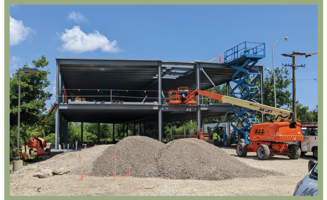
From pouring the foundations...