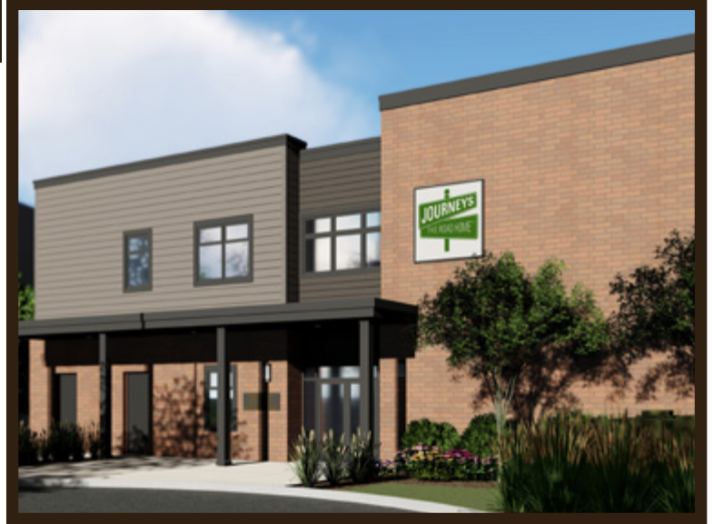
Rendering provided by HKM Architects + Planners, Inc.

The current 8,000 square foot facility and parking lot at 1140 E. Northwest Highway in Palatine will become a two-story, year-round fixed shelter site, clinical service day center and affordable housing purveyor for the homeless.